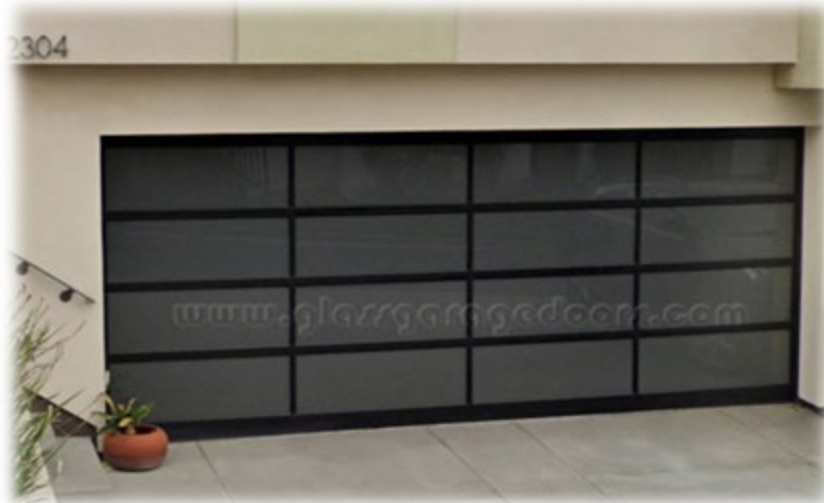
Residential & Commercial Garages